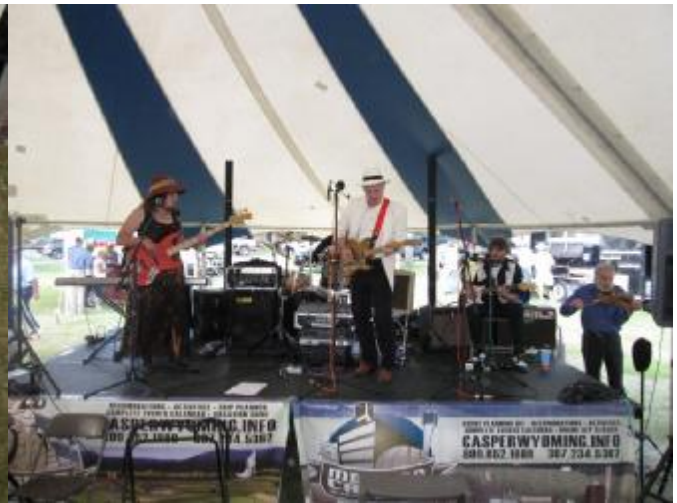
We had live entertainment.