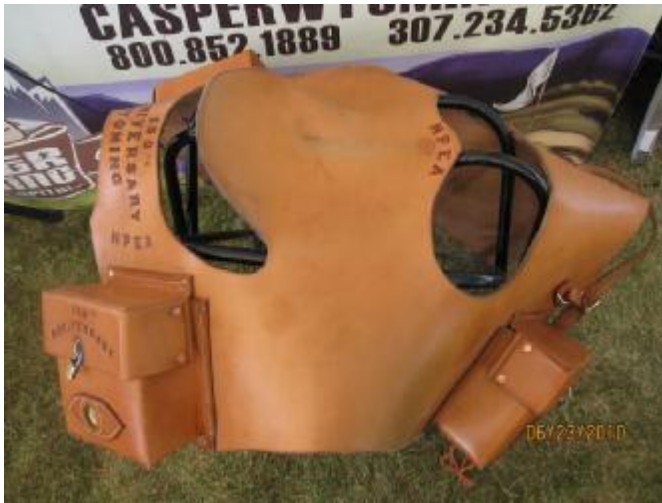
Another Mochilla, this one no doubt a reproduction.