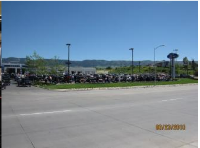
Model A's at Griener Ford