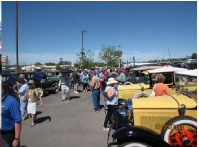
There were lot of Model A's to look at, about 150.