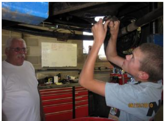
Mr. mechanic at work.