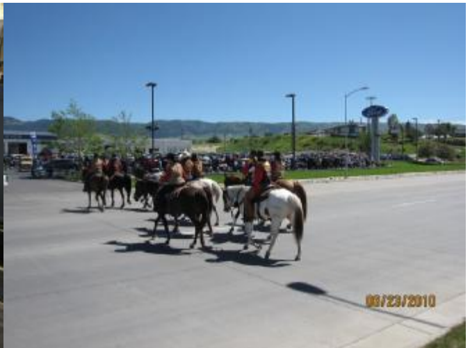
The Pony Express arrives.