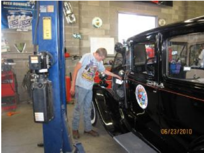
Checking the oil.