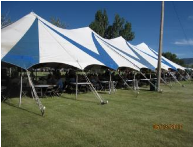
The get together was here.