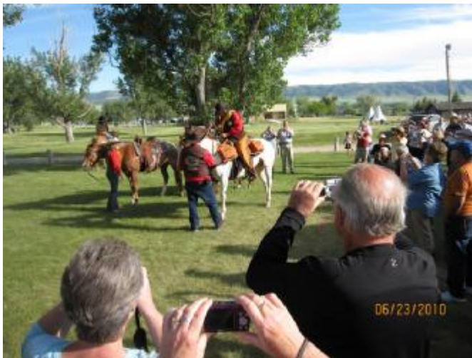
Pony Express live handoff (Transferring from one rider to another).