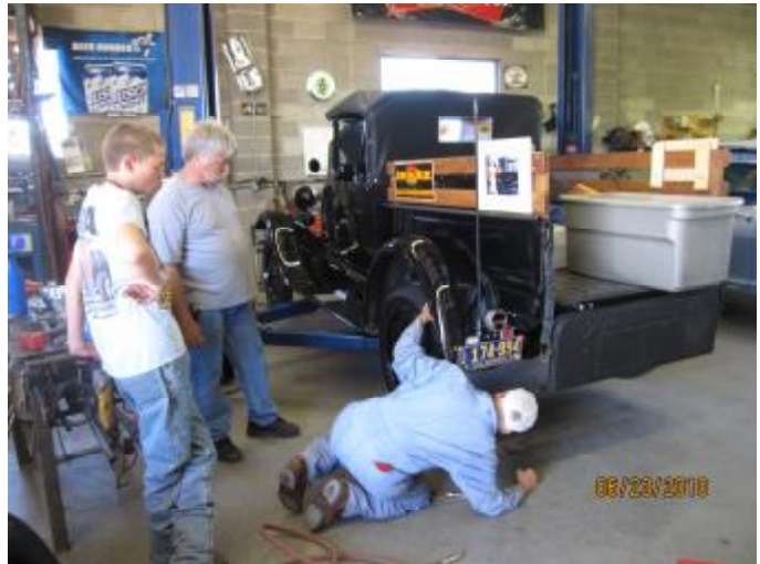
Getting 'Hank' ready for the trip home.