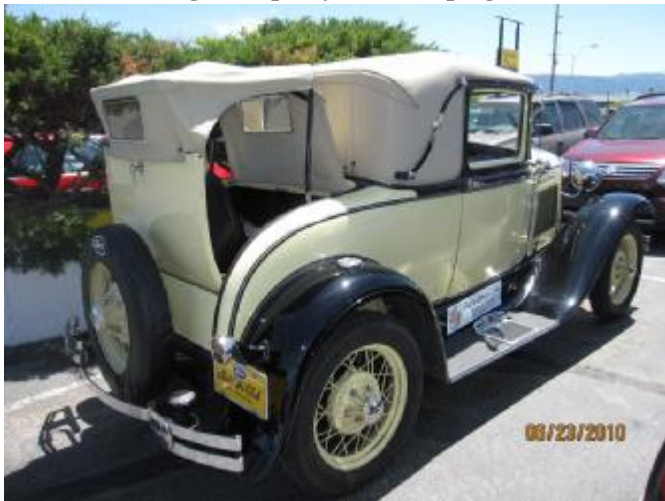
'Betsey', probably the most famous Model A of all Model A dom.